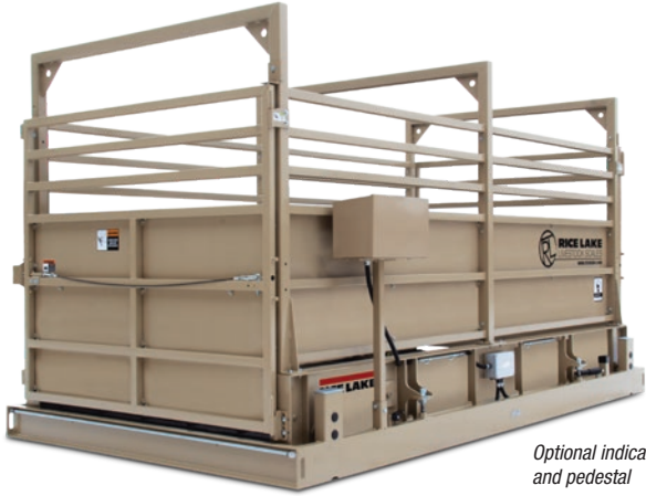
Optional indicator box and pedestal