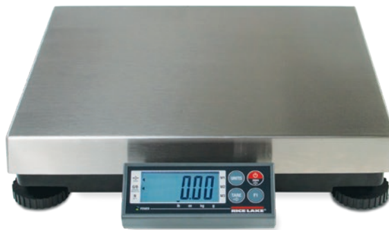
BP-S 12 x 14in