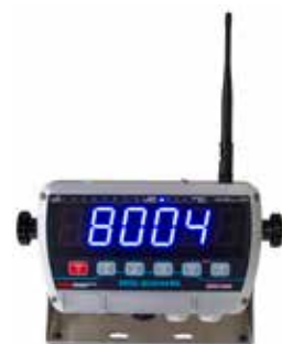
MSI-8004HD Indicator/RF Remote Display