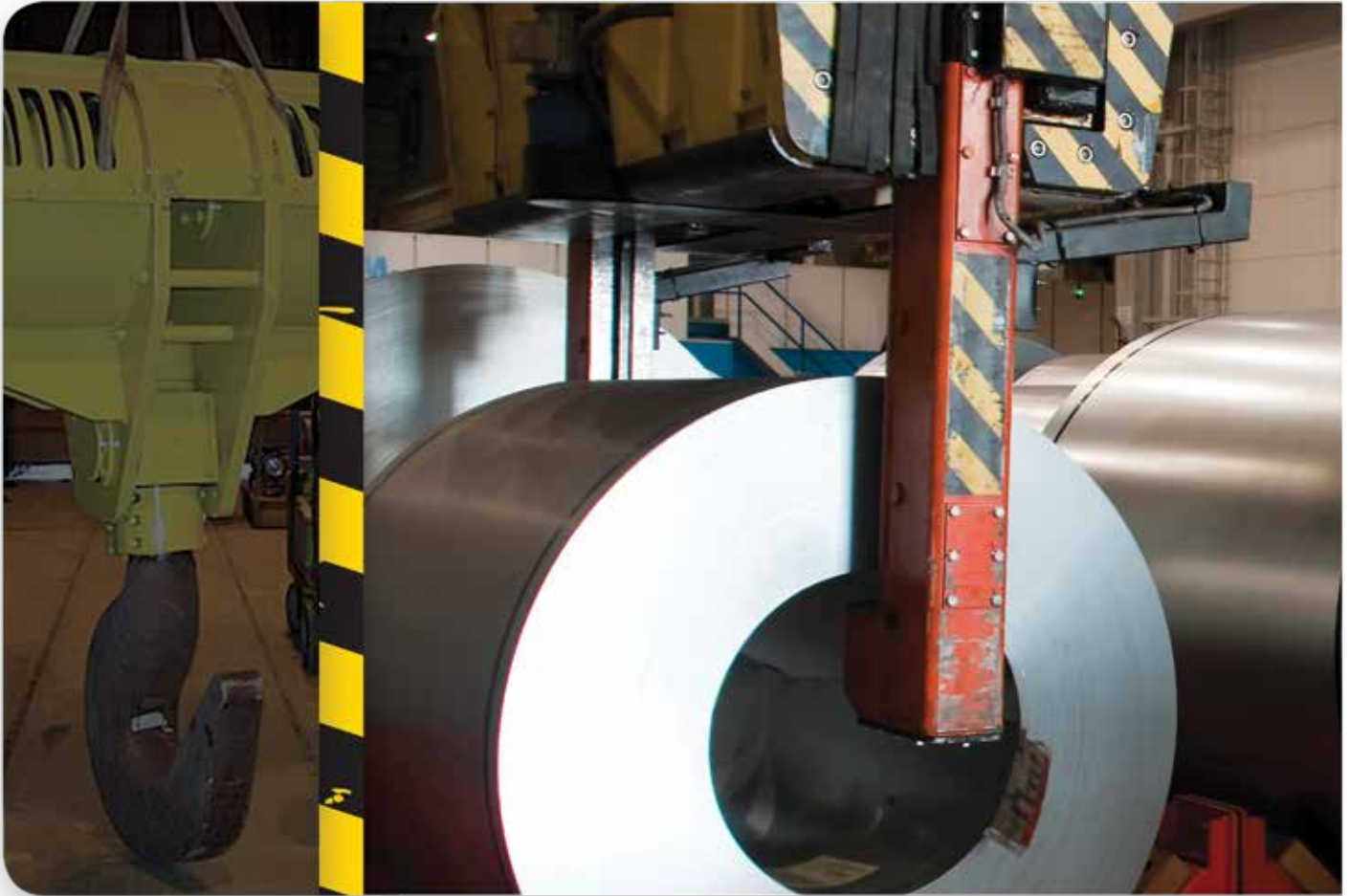
Clevis Load Pin Sensor