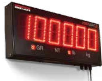
LaserLight2 Remote Display