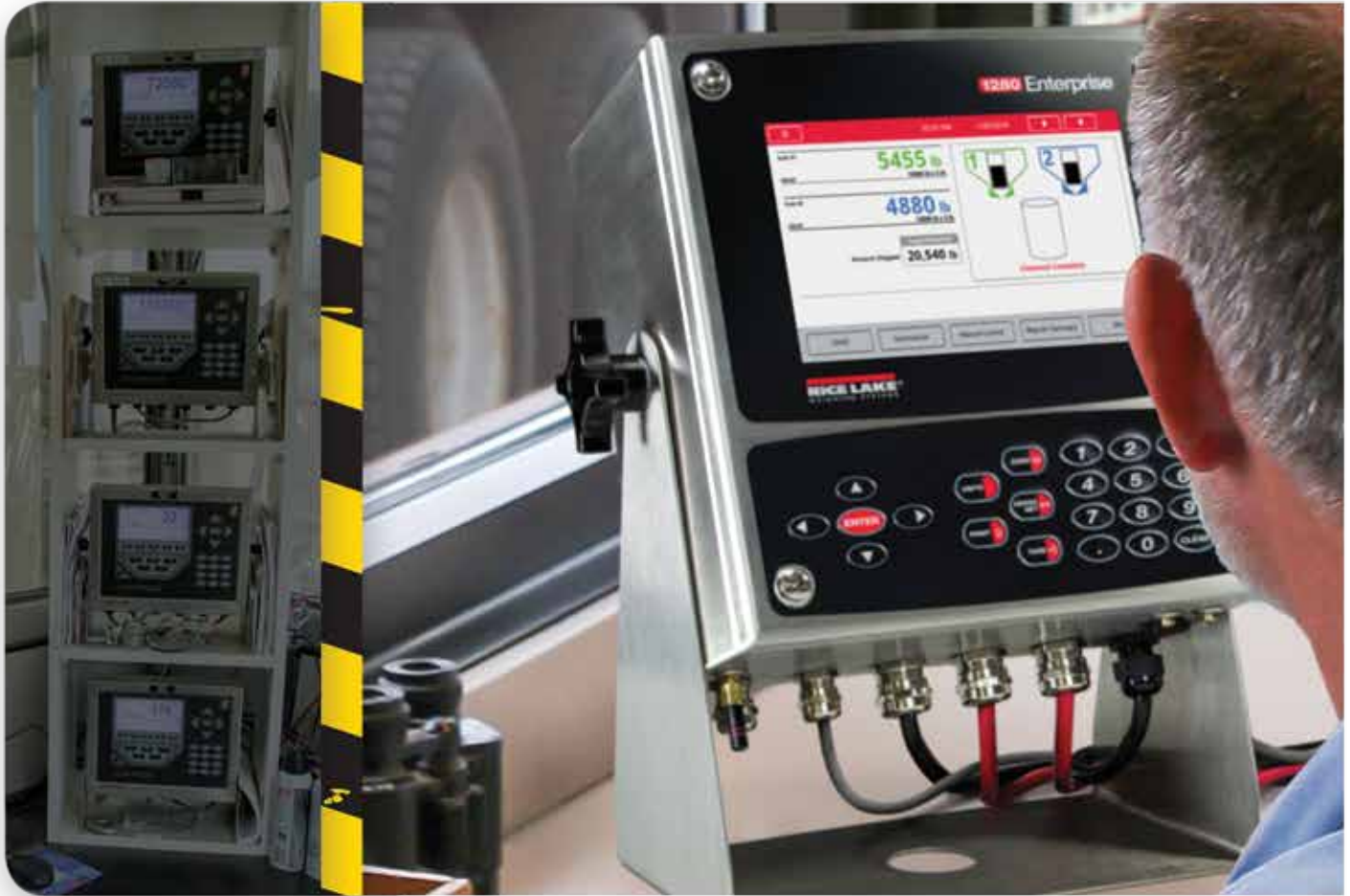
920i Digital Weight Indicator