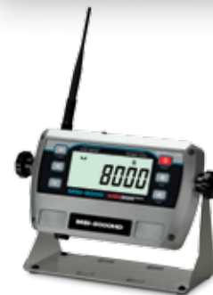
MSI-8000HD Indicator/RF Remote Display