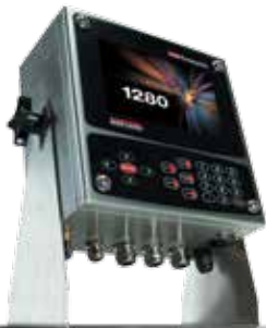
1280 Enterprise Series Programmable Weight Indicator