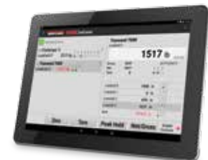
MSI-ScaleCore™ Module and MSI-ScaleConnect™ App