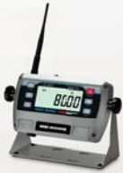
MSI-8000 HD RF Remote Display