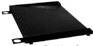
Summit Access Ramps